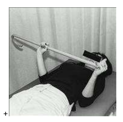
View Large | Download Slide(.ppt) Add to My JBJS

+Fig. 2-A:: Photographs showing passive external-rotation stretching with the patient supine.