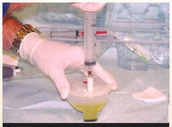
One would pull the yellow platelet poor plasma (as seen above) off the platelet "pellet." Then you would mix the remaining platelets with a small amount of the platelet poor plasma to create the autologous platelet concentrate (APC+).

Taylor, et. al., demonstrated in rabbit patellar tendons that injecting autologous blood was safe and that the injected tendons were stronger biomechanically than control tendons at 12 weeks.<sup>17</sup> Researchers have documented that autologous platelet concentrate (APC+) has four to six times the normal level of growth factors, which results in fibrocyte migration and induction of neurovascular growth.<sup>18</sup> Another group has demonstrated repair of the avasular area of dog menisci with