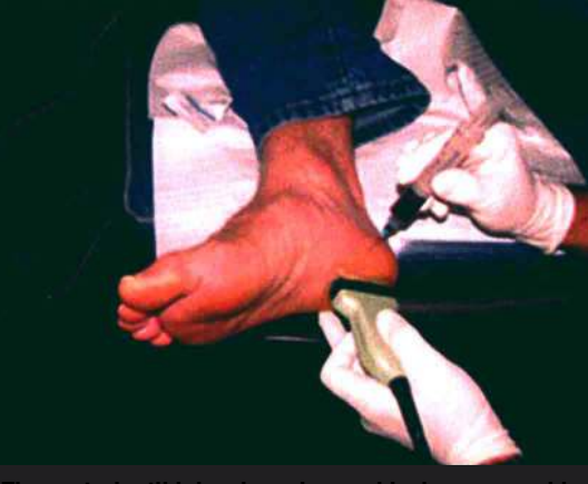
The posterior tibial and sural nerve blocks, one would inject APC+ from the medial aspect of the heel into the medial and central bands of the plantar fascia under the direct visualization of diagnostic ultrasound. This allows for a highly precise placement of APC+.

the use of fibrin clots with a morphologically similar tissue to the resected meniscus.<sup>19</sup>